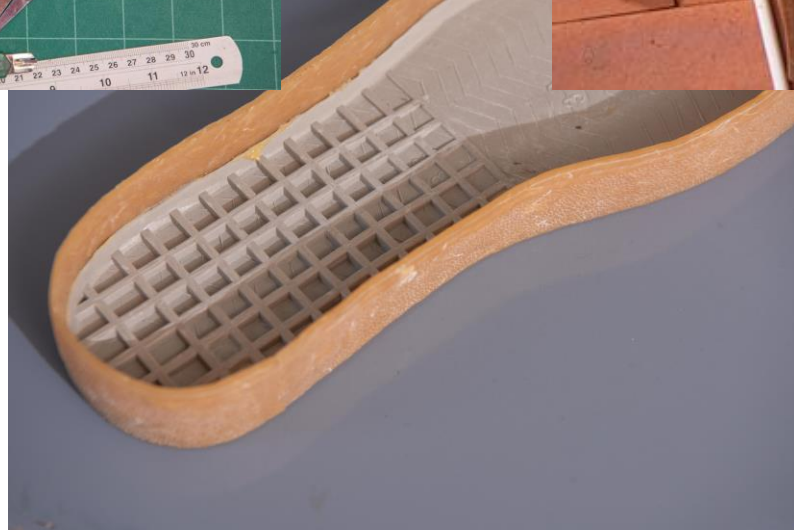
1 piece pattern design, “seamless” to avoid feet sore, orthopedic insole for balance walking/ ECO rubber outsole